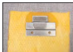
2-Part Mechanical Clips