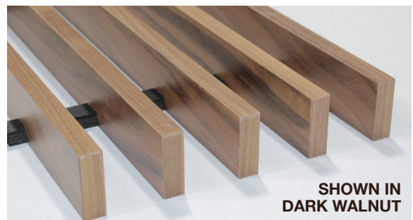
SHOWN IN DARK WALNUT