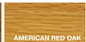
AMERICAN RED OAK