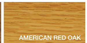
AMERICAN RED OAK