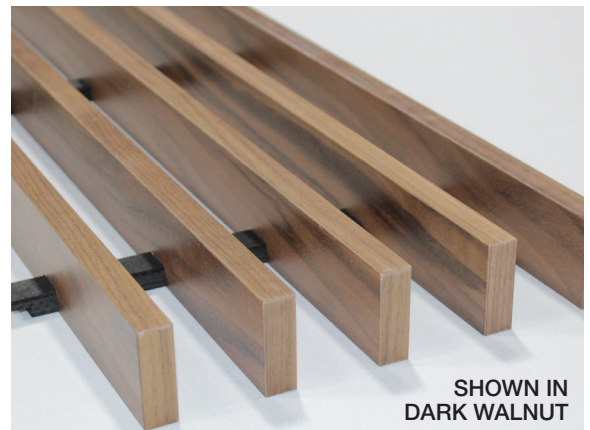
SHOWN IN DARK WALNUT