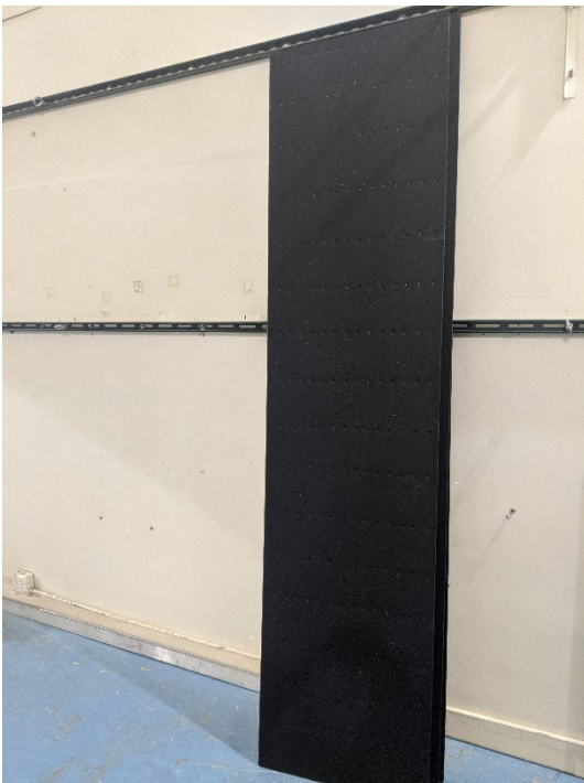
Figure 4 – Individual specimen panel, face oriented toward horizontal test surface