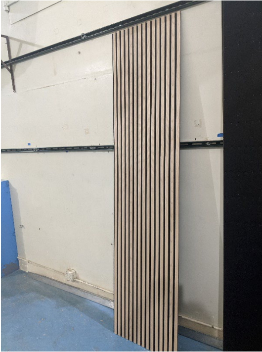
Figure 3 – Individual specimen panel, face exposed to sound field