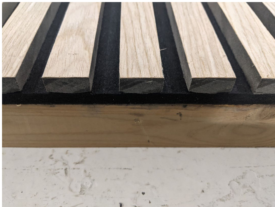
Figure 2 – Detail of specimen materials, as installed over furring strips