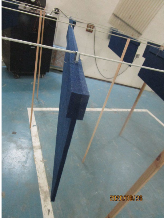
Figure 2 – Detail of specimen material, cross section