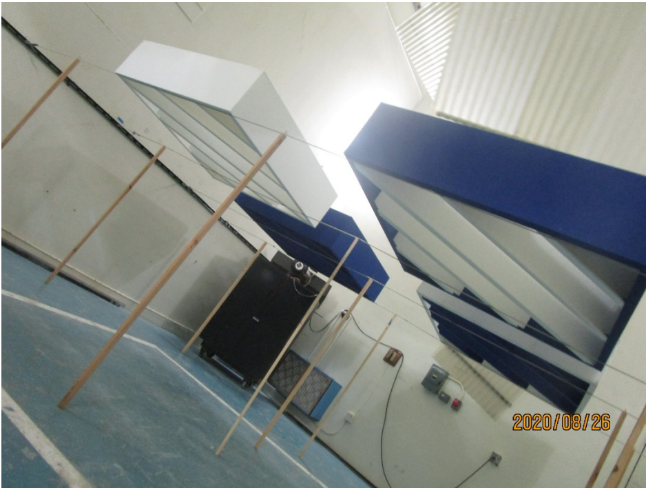
Figure 2 – Underside of specimen in test chamber