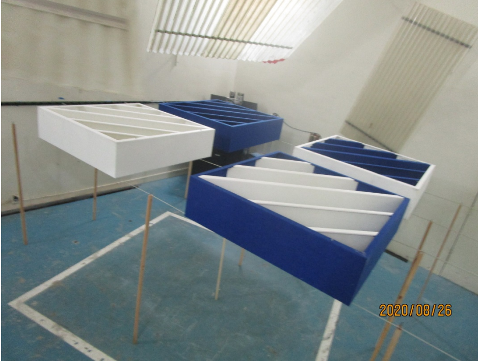
Figure 1 – Specimen mounted in test chamber