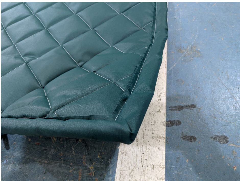
Figure 2 – Detail of specimen materials