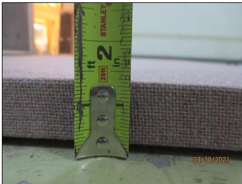
Photo No. 2 Close-up View of Installed Test Specimen