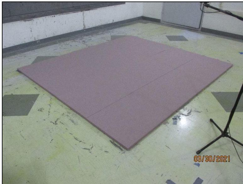
Photo No. 1 View of Installed Test Specimen