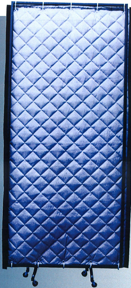
Acoustical Screen shown with BSC-25 Acoustical Curtain Panel and optional casters.