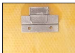
2-part Mechanical Clips